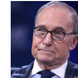
Larry Kudlow , host of Kudlow on Fox Business Network, Former Assistant to the President for Economic Policy and Director of the National Economic Council