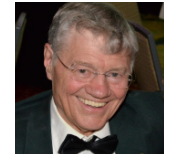
Tom Monaghan , Founder of Domino’s Pizza and Ave Maria School of Law